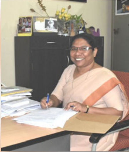
Director of MASHAL