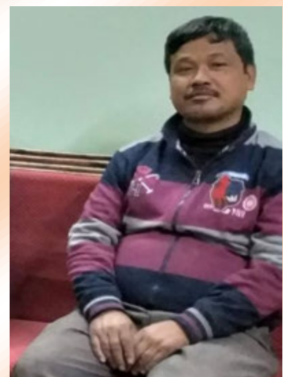
Driver and house keeping